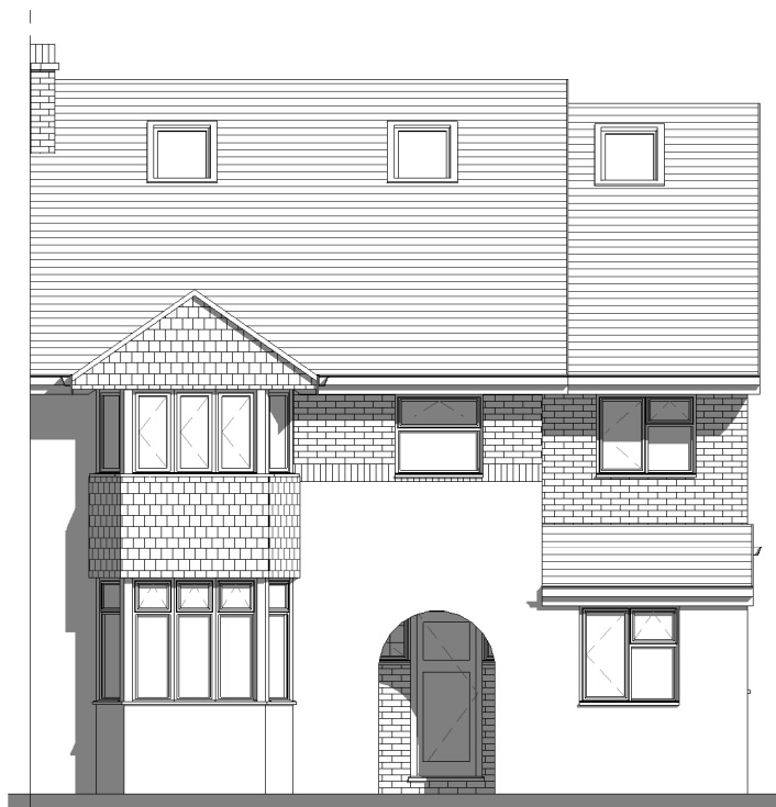
1 Proposed Front Elevation 1 : 100