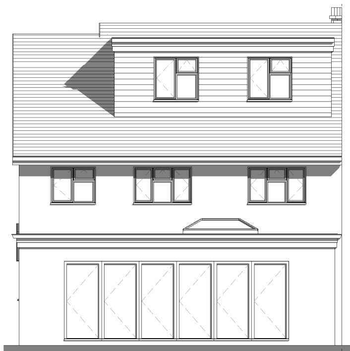
3 Proposed Rear Elevation 1 : 100