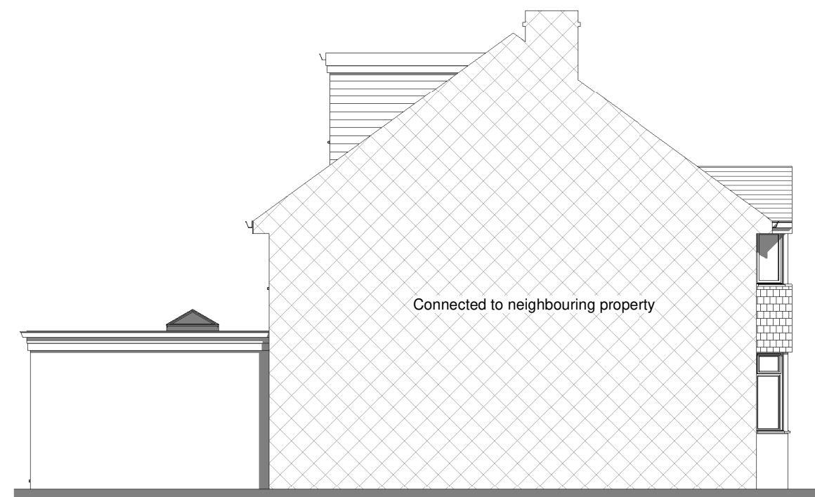
4 Proposed Side 2 Elevation 1 : 100